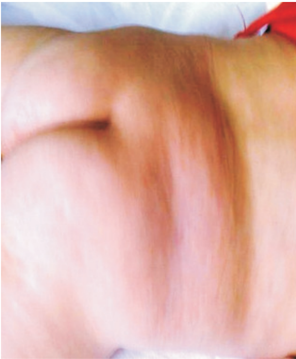
Figure 3. After 2 months of vincristine treatment.