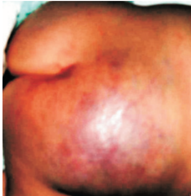
Figure 2. After steroid therapy, thrombocyte and fresh frozen plasma, ecchymoses regresses.

the patient once a month. The platelet count normalized and coagulation abnormality was not detected when he was x months of age (Fig. 3).