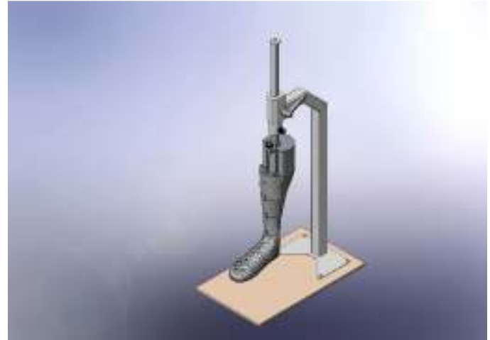
FIGURE 1 FINAL FOOT ASSEMBLY WITH THE SEVEN ALUMINIUM SEGMENTS.

The foot manikin was based in a model-shaped foot and built according anthropometric dimensions, after which it was submitted to a 3D scanning digitalization using the 3D Laser ZScanner®, from DeltaCAD. The resulting file was then converted into a *.stl file type for a final SolidWorks® processing stage. After this stage, all seven segments were manufactured in a CNC machine using an aluminium alloy (Fig. 1).