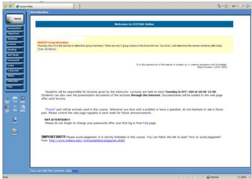
Figure 1. Introduction Page of the Online Environment