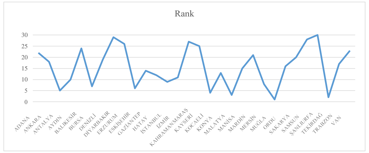
Figure 2. Average efficiency estimated ranks of models for each metropolitan.