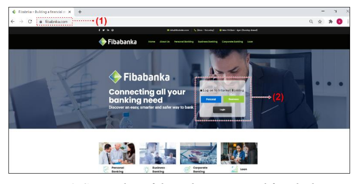
Figure 1. Screenshot of the website prepared for phishing attacks.

In the analyzed example, cyber fraudsters were designed to direct customers to the bank's official websites and the website they set up, and to enter the information in the form on the fake website (Figure 1).