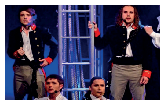
Figure 1. Musical "Juno and Avos" by A. Rybnikov, Moon Theater (2019)

Russian musical plays of 2010-2020 (Figure 1, Figure 2) often involve either dramatic actors with proper vocals or academic vocalists with an appropriate singing style. College educational programs emphasize either the art of acting or vocal performance. At times, pop singers who also lack any special vocal or acting training are invited to perform. All of these factors not only reduce the level of a musical but also hinder the further development of this genre in Russia.