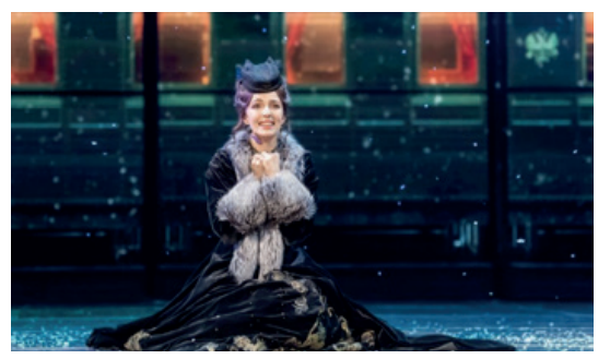
Figure 2. Musical "Anna Karenina" by R. Ignatiev, Moscow Operetta (2020)