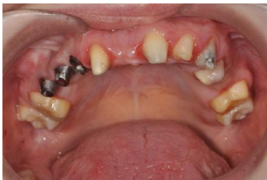
Figure 2. After post-core restoration and implant placements

The lower anterior 3 teeth which had lost the alveolar support and 3 embedded roots in the right maxilla had been extracted. Partial bone adjustments -upper and lower right side and upper left alveolar ridges- had been performed. The roots (23, 44, 45, and 46) had been exposed to the oral cavity. Endodontic treatments were done to these roots and 8 other teeth.