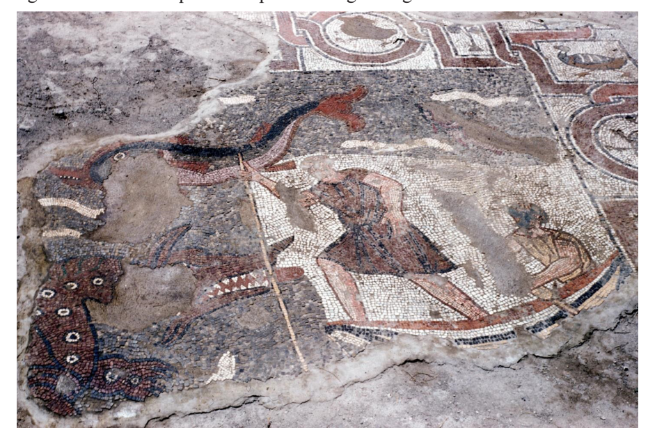
Figure 4 Catania. Funerary basilica in via Dottor Consoli, detail of the mosaic in the central nave (Pautasso 2015: 724 fig. 5).

A second unit (5,68 x 10 m), framed by the same band, but more incomplete, represents a marine scene (Fig. 4): on a small boat there are two men, of which one naked sitting, probably an erote, in the act of rowing and one standing, of greater dimensions, with short tunic and long pole. In front of the two figures, there is a sea monster with a big dragon head and a red coat dotted with white eyelets and on top of it a large polychrome fish. The background is blue, while the movement of the waves is represented by undulating rows of white tesserae. The religious theme of navigatio vitae goes beyond the boundaries of the Christian iconographic repertoire of the origins, starting from the popular profane art, which then changes its meaning: the image of the sea, symbol of cosmic chaos, of the unknown and of the evil, in the New Testament it will become the surface on which Christ walks, among his followers he will choose fishermen and the figure of fish will acquire a deep Christological significance.