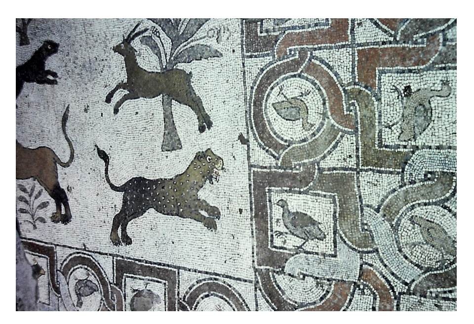
Figure 3 Catania. Funerary basilica in via Dottor Consoli, detail of the mosaic in the central nave (Pautasso 2015: 724 fig. 4).

deer going to the left, in the background various shrubs and small birds; finally, in the left part there are a big bird with high and robust legs, walking towards the left, probably an ostrich, in front of which a dog stands on the lower legs, the remaining part is incomplete.