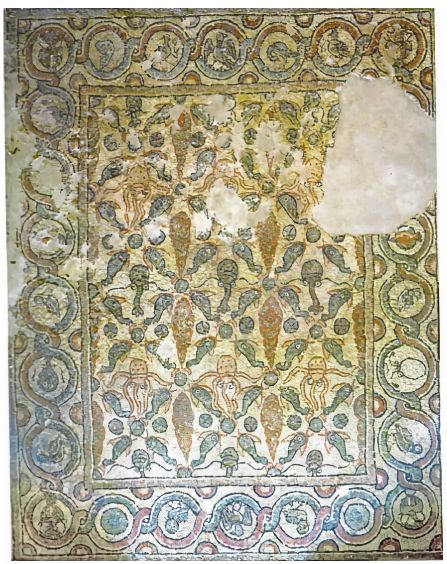
Figure 5 Catania. Funerary basilica in Nunziata of Mascali, mosaic of the central nave (Buda 2015: 50 fig. 44).