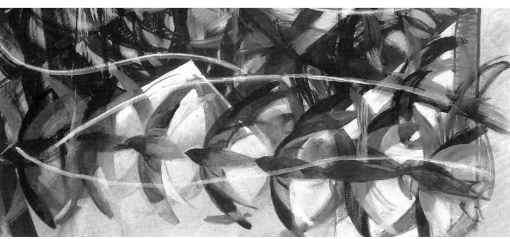
'Let Lastavica', Giacomo Balla, 1913.