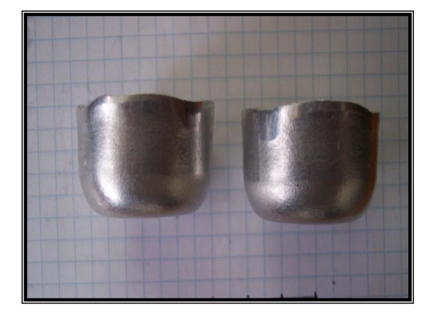
Figure 3. Earing test results.