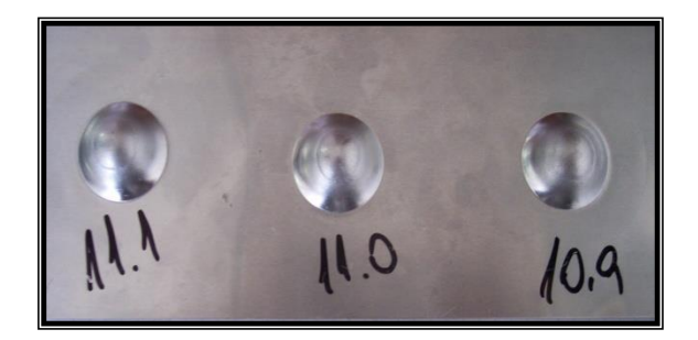
Figure 1. Erichsen test results

compare the results, there different curves were plotted in the same figure.