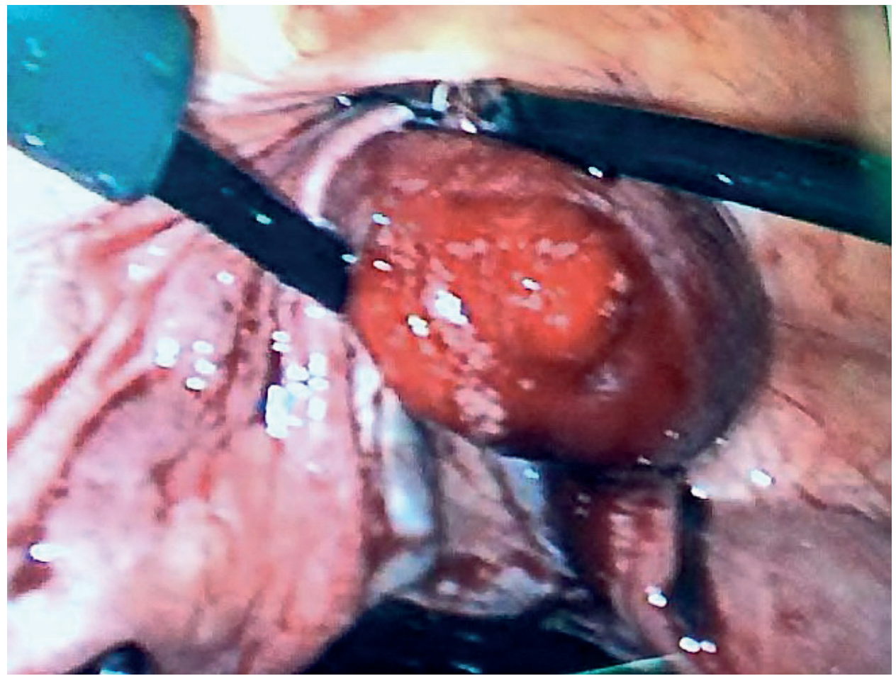
Figure 2: Ruptured rudimentary horn pregnancy.