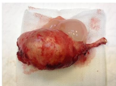
Figure 1. The macroscopic appearance of a mucocoele that was unpacked outside the abdomen.

Based on these findings, a gynecological surgical team performed a diagnostic laparoscopy and observed bilaterally normal adnexes and uterus. There was, however, a mass presumably of mesenteric origin. These finding prompted surgeons to consult the case with the general surgery department intraoperatively. The general surgery operative team made an abdominal exploration,