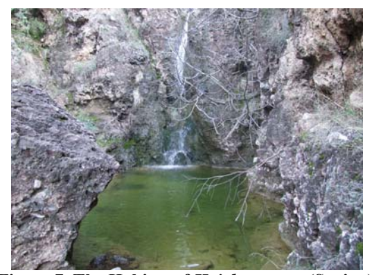
Figure 7. The Habitat of H. ichneumon (Spring)

Turkey, having the richest biological variety of Europe and Middle East, is counted as the ninth in terms of biological variety in Europe. Seven geographical regions of the country each possess different climate, flora and fauna types. Turkey is a rich country with 160 mammals, over 400 bird species, around 120 reptiles, 22 amphibians, 127 freshwater fish, and 384 fish (Atay, 2011). 20 mammalian species have been recorded living in Hatay locals having various height and climates in the second volume of "Important Natural Areas in Turkey" (Eken et al., 2006).