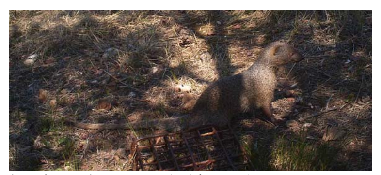
Figure 2. Egyptian mongoose (H. ichneumon)

Herpestes ichneumon (Figures 2, 3a, 3b) was pictured through the camera trap around Narlica region (36° 12' N; 36° 13' E; 265 m.) in Antakya on 26.11.2011 during field survey under the project with the title "The Striped Hyaena ( Hyaena hyaena L.) Ecology in Hatay". There are a stream whose depth gets 50 - 100 cm and width 1 m on average in winter (getting very little water in summer), sparsely populated pine trees, olive trees and bushes in the area where the pictures were taken. By digging the ground, H. ichneumon entered into the feeder used to take picture of H. hyaena L. at approximately 100 m northwest (36° 12' N; 36° 13' E; 246 m.) of the same region on 23.03.2012 (Figure 4). The Egyptian Mongoose was released after its necessary body size was taken through compass and tape measure without scaring the Egyptian Mongoose while it was inside the feeder.