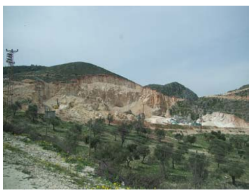
Figure 6. A Stone Quarry in The Habitat of H. ichneumon