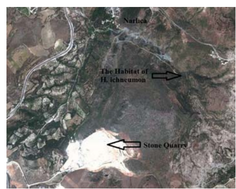
Figure 5. Stone Quarry and The Habitat of H. ichneumon

appearance of the striped hyaenas during the past 5 years. Accordingly, all the caves and dens which could be used by striped hyaenas have been examined through camera traps during survey on the area; however, no signs have been encountered to prove the existence of striped hyaenas in the area mentioned above. Therefore, the possibility that striped hyaenas have emigrated by force gains weighs because of such excessive quake and noise resulting from dynamite.