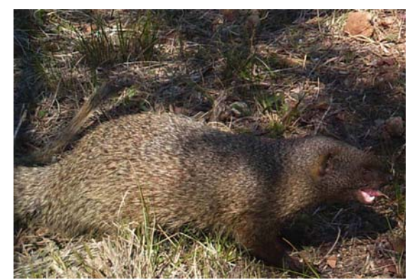
Figure 3 b. H. ichneumon feeding on chicken

The measurement of the Egyptian Mongoose is as follows: