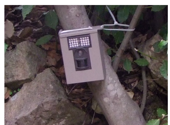
Figure 1. Camera trap used on the field survey

The project named as "The Striped Hyaena ( Hyaena hyaena L.) Ecology in Hatay" set by the authors in 2011 and supported by Mustafa Kemal University is being maintained as field survey on a land of nearly 60 hectares in Altınözü and Yayladağı districts, in the city Antakya, Hatay. Stream banks, caverns, caves, rocky sites, scrubby lands and sparsely populated wooded areas known as ecological space of H. hyaena are visited through field surveys applied two days a week. Foot trace, scat, bone and living H. hyaena L. are looked for in such areas all day and night. Taking pictures of H. hyaena L. has been planned in the study having placed camera-traps onto the passages of H. hyaena L. as well as caves and cavern entries. Feeders made of iron sheet with a dimension of 50x30x10 cm so as to take pictures of H. hyaena L. Inside those feeders have been put bones of sheep and chicken. 3 camera traps have been placed into the entry of cave while two around the place where these feeders exist (Figure 1). Camera traps have been checked once a week. The places of camera traps are changed after the snapshots in the camera traps are transferred to the computer.