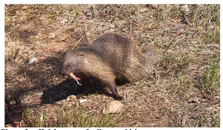
Figure 3 a. H. ichneumon feeding on chicken.