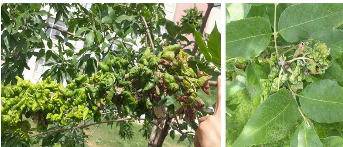
Figure 2. Malformations caused by Prociphilus fraxinifolii on Fraxinus pennsylvanica

As of July 2021, P. fraxinifolii was locally distributed in Bishkek (Djal district). This pest was firstly recorded in south Kazakhstan among Central Asian countries in summer 2012 (Kadyrbekov 2017) which is the border country in the north with Kyrgyzstan. Information about the presence of the pest from other Central Asian countries is absent. Possibly, it was entered Kyrgyzstan before 2017 with infested nursery stock. Therefore, for the areas where ash tree needs to be introduced, quarantine must be strengthened when the seedlings are transported to prevent the introduction of this kind of aphid. Further surveys are necessary to determine pest's wider distribution throughout the country.