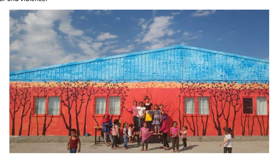
Image 6. Saime Uyar, 2019. (Malatya Refugee Camp, Turkey). (Acrylic Paint on the Surface of the Wall) (2.7 m x 14.50 m).

studies, it has been revealed that art is much more necessary, especially for children who are exposed to war and violence.