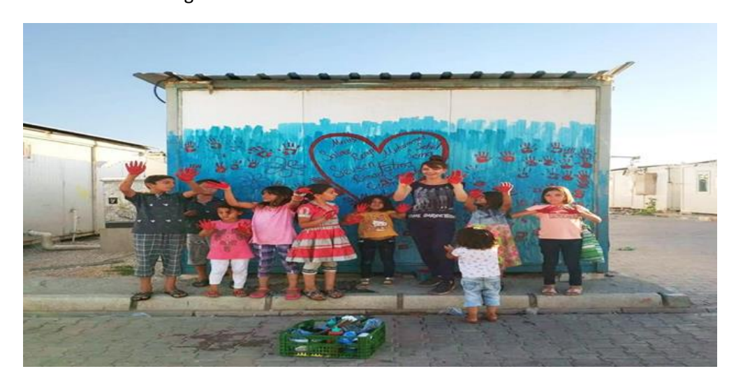
Image 5. Saime Uyar, 2019. (Malatya Refugee Camp, Turkey). (Acrylic Paint on the Surface of the Wall) (3m x 7m x 2,4 m).

In the work in Image 4, the slogan "Let the wars end and children be happy" expressed by Syrian refugees in their mother tongue is included.