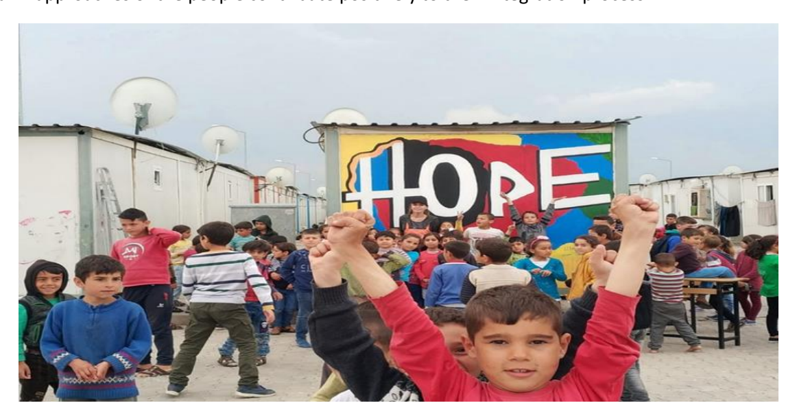
Image 7. Saime Uyar, 2019. (Malatya Refugee Camp, Turkey). (Acrylic Paint on the Surface of the Wall) (3m x 7m x 2,4 m).

These artistic works carried out in the camp have not only touched the deteriorated moods of the refugees but also improved the environment in which they live every day. However, another important contribution is that they are on a common platform with the citizens of the host country. In addition to the feeling of trust given by the door opened by the Republic of Turkey to them, the sincere and warm approaches of the people contribute positively to their integration process.