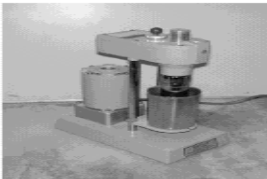
Fig. 1. Fann viscosimeter 35A.

Equipment used: Rheometer was used Fann 35 A 6-speed (Fig.1). Speeds were 600, 300, 100, 6 and 3 rpm (rotation per minute). The measured parameters are the plastic viscosity and yield value.