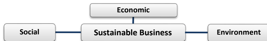
Exhibit-2-1: The Dimensions of Sustainable Business

The main objective of businesses to maximize profits in the short term and in the long term is to maximize shareholders' wealth. However, from the operation results of an enterprise affect not only the owners and its partners, but also affect the community, various institutions and organizations (Şengel, 2011). The activities of businesses are under pressure from these groups. Today, as the pressure increases day by day due to environmental factors (Aydın, 2012). In this context, businesses need to consider not only the economic dimension of their activities but also need to consider the social and environmental dimensions (Nowduri and Al-Dossary, 2012: Okka, 2005:15).