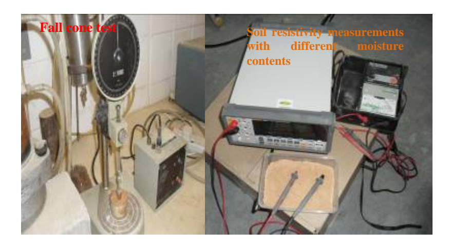
Figure 1.Soil electrical resistivity measurement for soil state determination

The research work on determination of LL and PL of soil through electrical resistivity is conducted at University Kebangsaan Malaysia with the cooperation of Ministry of Science, Technology and Innovation of Malaysia. The fall cone test for the different type of soil sample is done in the geotechnical laboratory of Civil and Structural Department, UKM. The data collection for soil resistivity measurement is carried out using digital precision multimeter, model 8846A, Fluke at construction site of University Kebangsaan Malaysia (UKM) in Bangi, Selangor, Malaysia shown in Fig. 1. The study on the relationship development between soil electrical resistivity and LL, PL of soil is done and the analysis is performed using MATLAB 2009 in Geotechnical Laboratory, Faculty of Engineering and Built Environment, UKM.