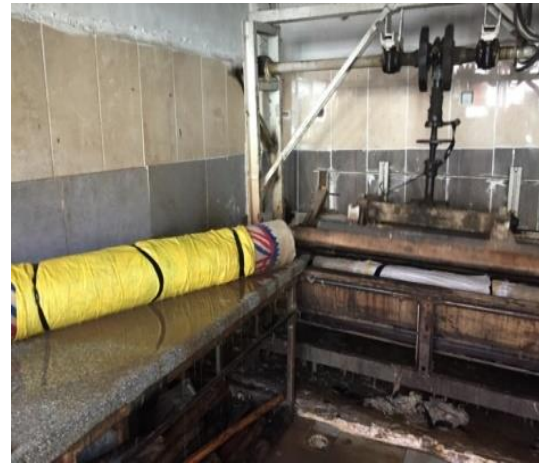
Figure 5. Stereotype

It is made of thick and densely sewn fabrics such as 1.5-meter canvas or tarpaulin, which is used at the end of the mold used to prevent the wear of the mat that is wrapped in a standing or kicking machine, and is wrapped and tied on the mat.