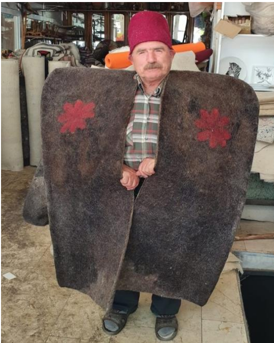
Figure 16. Model