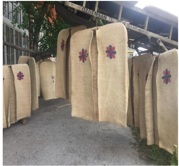
Figure 14. Drying

For the drying process, the drying process is carried out in natural weather conditions on hangers and it is made ready for the use of shepherds