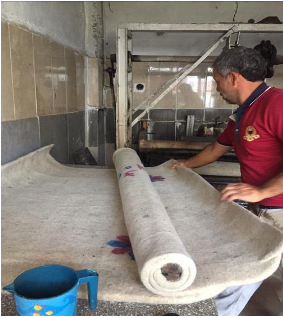
Figure 11. Cooking

After the topping process, the cooking process is started and the felting process is realized by cooking with hot water for ten hours.