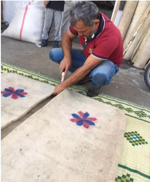
Figure 12. Cut in half

After cooking, the bran is given its final shape and the front and neck parts are opened with scissors and hung to dry.