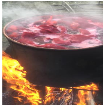
Figure 1. Paint boiler

It is a dye boiler used in the coloring process of wool. It is made of copper and aluminum.