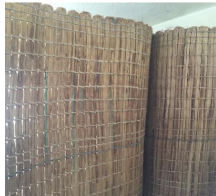
Figure 2. Wicker

In the past, mats woven with rope from dried plant stems and reed stems were used, but nowadays, synthetic fiber-textured mats are preferred due to their rapid wear, high cost and laborious construction. The wool of the felts, which are formed with or without naaş, are laid on the mould. This mat is used in kicking and cooking processes.