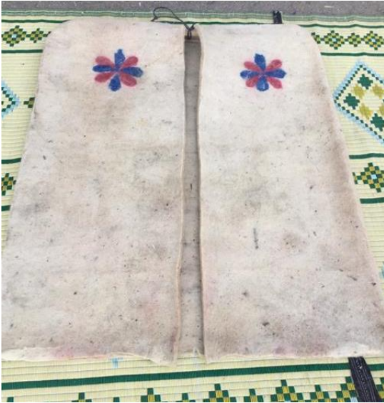
Figure 15. View