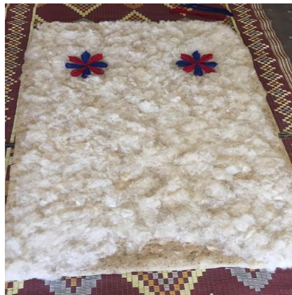
Figure 10. Pattern placement

Wool is sheared in autumn to make felt. Wool is washed for cleaning and combed by drying. When the wool throwing is completed, soapy water is sprinkled.