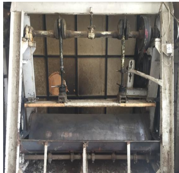
Figure 6. Kicking Machine

The felt recoiling process, which was done with the knee, feet and chest in the past, is now provided by the recoiling machine with the development of technology. The molds, which are wrapped with molds in the form of a roll, are placed in the kicking machine by tying rubber ropes on the edges. It takes about two, two and a half hours in the machine. Body power has been replaced by a kicking machine. In some regions, this machine is replaced by the same process in the cooking machine[4].