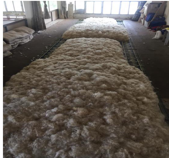
Figure 9. Sprinkling of wool

In the next stage, the second layer of wool is thrown. When the beating is completed, the edges are smoothed by hand and the second water is sprinkled, the third layer of wool is thrown and the edges are collected by hand and smoothed.