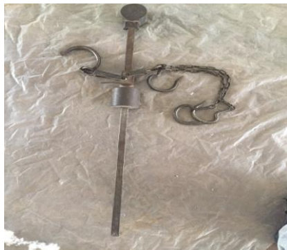
Figure 4. Scales

It is the tool used to determine the amount of wool to be spent on the product to be made of the wool coming out of the carding machine.