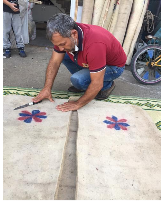
Figure 13. Correcting the edges

After the topping process, the cooking process is started and the felting process is realized by cooking with hot water for ten hours.