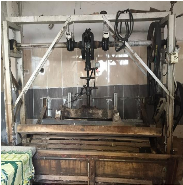
Figure 7. Cooking Machine

hours. In the past, this process was done in felt baths [2].