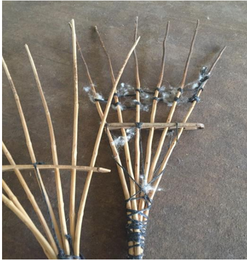
Figure 3. Rod

It is a tool that ensures that the wool to be thrown on the mat, which is 40-50 cm in length and opened in the form of a fan with five or six handles, made of walnut, redwood, poplar branches, is spread evenly and the wool is collected on the edges.