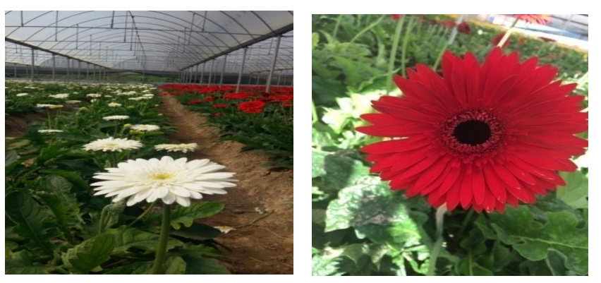
Gerbera'Ulaş' (a)Gerbera'Yeliz' (b)Figure 1. Images of materials used (a,b)Şekil 1. Kullanılan materyallerden görüntüler (a,b)

The study was carried out in the polyethylene greenhouse of a producer in Erbaa District of Tokat province between May-October 2017. The red and white varieties of the gerber daisy species were used in the study, considering they were the most preferred varieties. Seedlings of Gerbera jamessonii x hybrida "Terre Ice" (local name: Ulaş White) and "Terra Yeliz" (Local name: Red gerber daisy Yeliz) produced in Antalya were used as the plant material of the study (Figure 1).