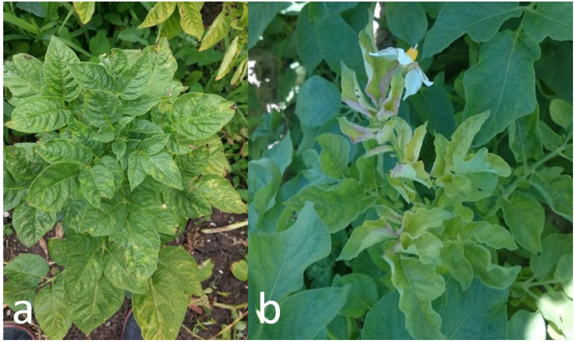
Figure 1. Mosaic and stunting symptoms (a), and rolling in the top leaves and coloring on potato plants (b)

observed in surveyed area (Figure 1 and 2). Similarly, these symptoms were reported by previous studies (Brunt 2001, Stevenson et al. 2001, Guner and Yorgancı 2006, Yardımcı et al. 2015)