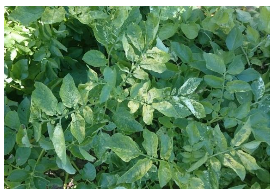
Figure 2. AMV symptoms on potato plants Şekil 2. Patates bitkilerinde AMV belirtileri

All 288 potato leaf samples were tested by DAS-ELISA against to PVY, PLRV and AMV. The incidences of PVY, PLRV and AMV viruses infecting potato are given in Table 2. According to the results of DAS-ELISA, 54% of samples were infected with PVY, PLRV and AMV. PVY was the most common viruses in the survey area with the ratio of 50%. They are followed by PLRV and AMV 5.5% and 1.38% in all tested samples, respectively. Mixed infections also