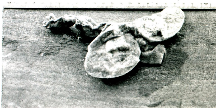
Fig. 1: Macroscopic appearance of the tumor.