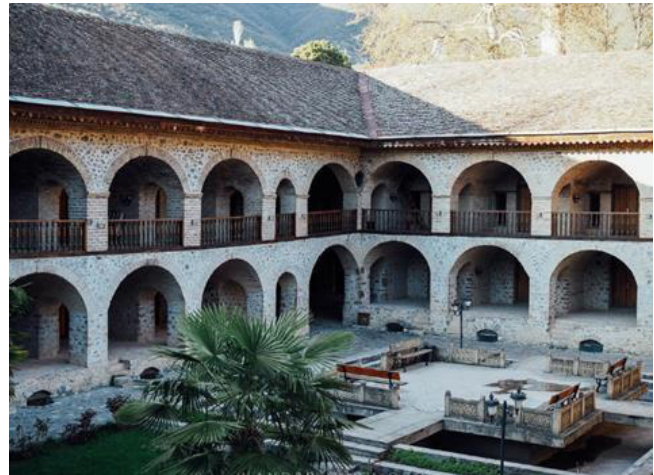
Figür 2 – Upper Caravanserai

( https://azertag.az/en/xeber/Seven_magnificent_caravanserais_of_Azerbaijan-1181465 / Date Accessed: 15.05.2021)