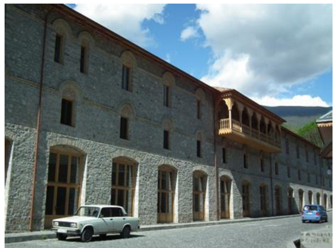
Figür 3 – Lower Caravanserai