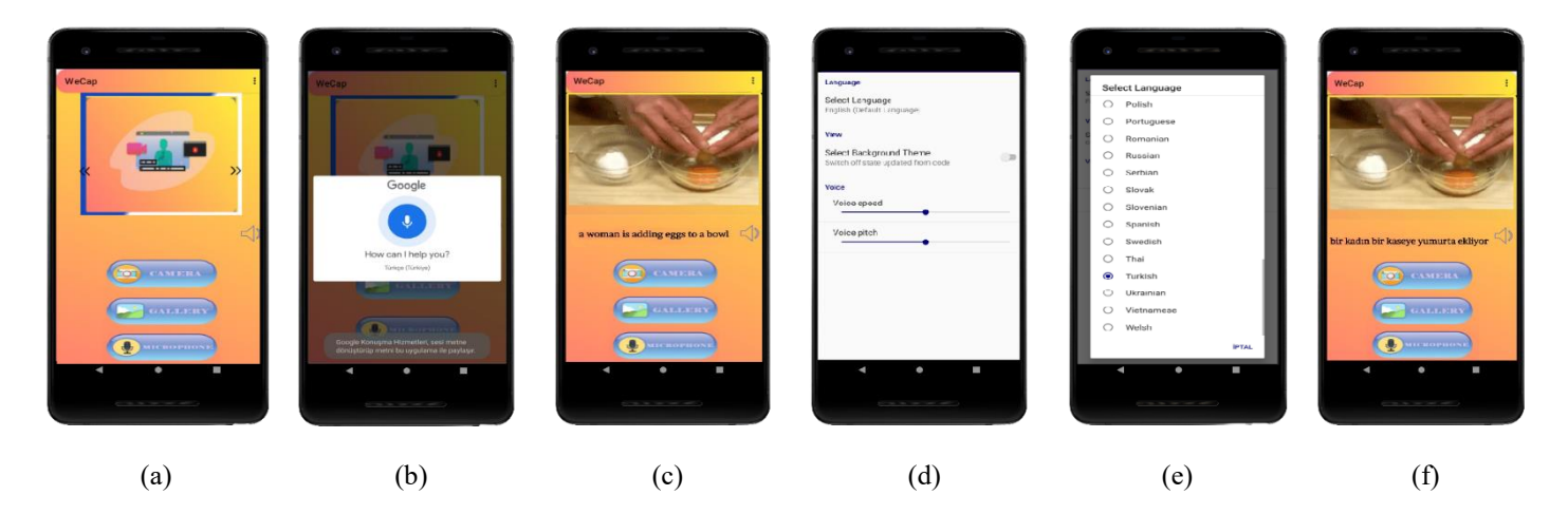
Figure 2. Android application: the homepage is given in (a), voice command is shown in (b), the generated caption with video is shown in (c), settings, language options and the translated caption are given in (d), (e) and (f).

The performance metrics BLEU-n (n = 1, 2, 3, 4), METEOR, and ROUGE-L, evaluate the similarity between a machinegenerated caption and the reference captions in the machine translation systems. SPICE is designed to evaluate captioning tasks that compare the semantic propositional content of generated and reference captions. CIDEr is also designed for captioning, examining the average cosine similarity between the generated and the reference captions. The results are sorted based on the CIDEr metric due to its better correlation with human judgment than BLEU-n, METEOR, SPICE, and ROUGE-L.