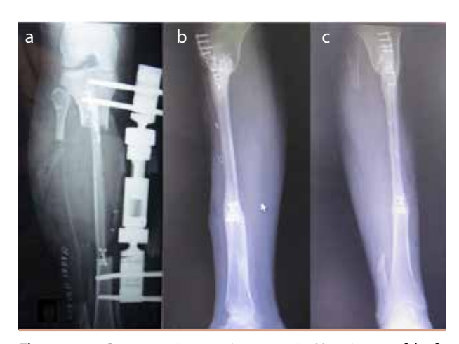
Figure 3. a-c. Postoperative anterior–posterior X-ray image of the fibula after being adapted to the tibia (a). Lateral (b) and anterior–posterior (c) X-ray image of the fibula flap with enhanced calibration, having been adapted to the tibia after 12 months following surgery

Following proper recovery, the patient was discharged on postoperative day 10. She was regularly monitored for 12 months. Beginning from postoperative month 2, controlled load was applied to the fibula flap, accompanied by stepping and walking exercises. The X-ray evaluation in postoperative month 12 revealed that fibula calibration had increased to 3/4th of the normal tibia thickness (Figure 3a–c). In the last follow-up examination, it was observed that there was no difference in the length between the extremities and that the patient was able to stand and walk without support (Figure 4).