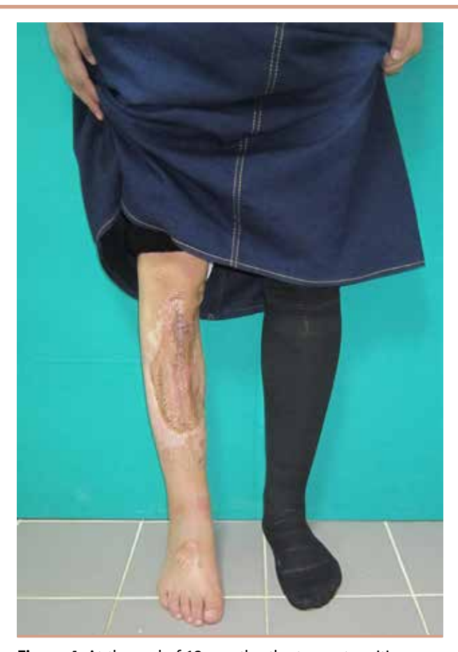
Figure 4. At the end of 12 months, the two extremities were equal in length and the patient could stand without support

Kahraman et al / Reconstruction of the Tibia with a Bipedicle Fibular Flap