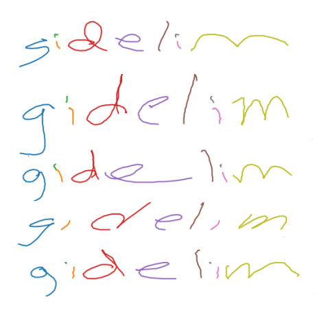
Figure 2. Examples from generated synthetic words.

which contain symbols other than letters, both upper and lowercase. Finally, we replace Turkish characters { c, C, \check{g}, \check{G}, 1, \dot{I} , ö, Ö, ş, Ş, ü, Ü} with their counterparts in the English alphabet, i.e. {c, C, g, G, i, I, o, O, s, S, u, U} since they are not contained by the UNIPEN dataset. We end up with a word list of 99,479 words and 34,062 unique words. We generate handwritings from that word list by randomly choosing a writer who has samples for all the characters in that word. If there are multiple samples of one character to be written then one of them is chosen randomly. Finally, all chosen character samples are placed on a baseline with randomly chosen spaces between them. The synthetic dataset has 74,859 word samples from a lexicon of 25,223 by 526 writers. Figure 2 shows some examples of the generated words. It should be noted that some of the words in the BOUN Treebank corpus are not included because there is not any writer who has samples for all the characters required to write them.