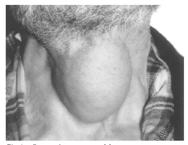
Fig. 1 - Preoperative appearance of the mass.

Thyroglossal duct cysts are usually found adjoining the hyoid bone (75%) as asymptomatic masses. [5] If the foramen cecum is patent, then fluid or inflam-