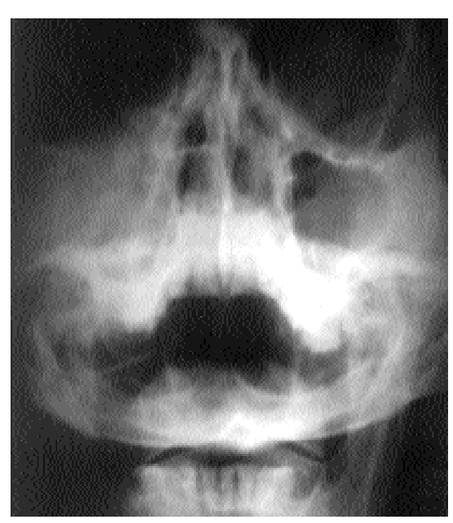
Fig. 1 - Water's view of the facial bones showing opacification and expansion of the right maxillary sinus.

Fibrous dysplasia is usually a slowly progressive benign disease that develops over several years,