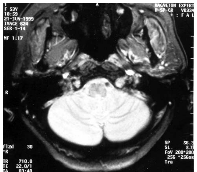
Fig. 3 - Magnetic resonance imaging with fat suppression provided a more detailed appearance of the hypoglossal canal masses.

Schwannomas (neurilemmoma, neurinoma, neuroma) are benign tumors arising from Schwann cells. They may originate from any of the cranial or spinal roots except for the olfactory and optic nerves. Approximately 30% to 50% of all schwannomas arise