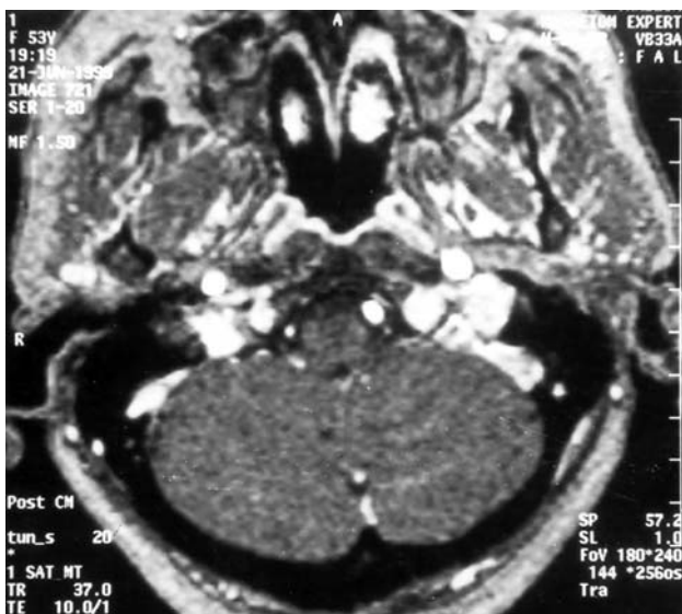
Fig. 2 - Magnetic resonance imaging with gadolinium shows bilateral enhancement of the hypoglossal canal lesions (1 x 0.8 cm on the left and 1 x 0.5 cm on the right).

tomography (CT) in bone window revealed expansion of both hypoglossal canals (Fig. 1). Magnetic resonance imaging (MRI) showed bilateral masses located at the area of hypoglossal canals. The masses were hypointense relative to the brain on T 1 -weighted spin-echo scans and hyperintense on T 2 -weighted scans. There was a homogeneous enhancement following gadolinium administration. Magnetic resonance angiography demonstrated nonvascular character of the masses (Fig. 2). Magnetic resonance imaging with fat suppression showed that both of the masses were intracanalicular and they were not related with the jugular foramina (Fig. 3). A diagnosis of bilateral hypoglossal schwannoma was established radiologically. Family history and systemic examination did not provide any evidence for neurofibromatosis. Genetic counseling was reported as insignificant. The patient refused any surgery or gamma-knife surgery and was, therefore, scheduled for follow-up MRI scans every six-months. During a two-year follow-up period, the size of the bilateral tumors and her clinical complaints remained unchanged.