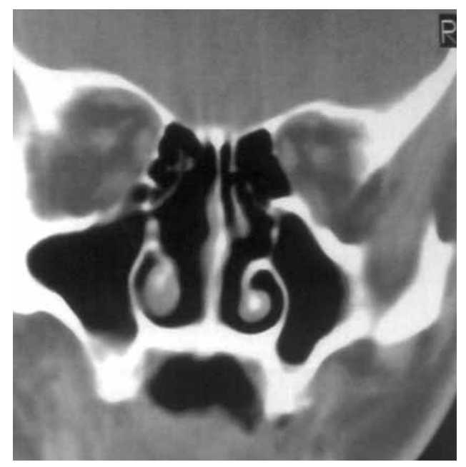
Fig. 3 - Postoperative view of the nasal cavity.

removed from the ostiomeatal complex region, however because of its size; it was taken out via nasopharynx (Fig. 1b). The lesion was not infiltrative to the surrounding tissues. Endoscopic anterior ethmoidectomy was also performed in the right nasal cavity for nasal polyposis. General appearance of the mass in the right side was as usual nasal polyp. Postoperative histopathological examination revealed the left nasal mass as schwannoma. The cells were spindle shaped and formed short fascicles. The spindle cells were often arranged in a palisading fashion. İmmunohistochemically, the tumor cells showed immunoreactivity for S-100 protein (Fig. 2). The other polypoid tissues were confirmed as "nasal polyp" by histopathological examination. The patient was symptom-free and endoscopic and paranasal sinus CT examinations were healthy after nine months (Fig. 3).