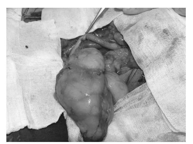
Fig. 3. Lipoma dissected from the carotid wall which has a weak medial vascular layer.

least 10 cm in one dimension or weighing a minimum of 1000 g.<sup>[6]</sup> Large lipomas, as large as 55x38 cm (24.950 g), have been reported in the literature related to this subject.<sup>[2,7,8]</sup>