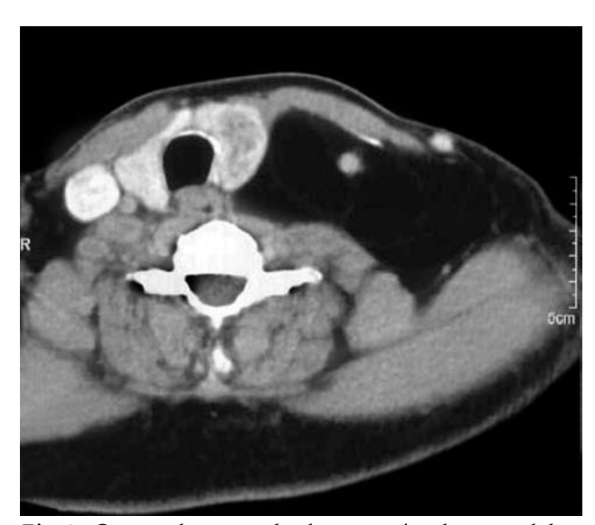
Fig. 1. Computed tomography demonstrating deep seated, heterogenous mass surrounding the carotid artery.

Surgery was planned for this patient. During the operation, a giant lipomatous lesion deep from under the sternocleidomastoid muscle was observed. The mass depleted constricted the internal jugular vein laterally and it was extending from the submandibular region to the substernal plane. The tumor was removed in a monoblock fashion from the posterolateral neck and upper mediastinum. However, while dissecting the tumor from the common carotid artery, we observed that the mass was firmly attached to the whole common carotid wall by fibrous bands (Fig. 2). During the dissection in the lower 1/3 of the artery, a sudden rupture has occurred without permitting a primary saturation for the lesion destructing the medial muscular layer of the common carotid wall. In order to avoid