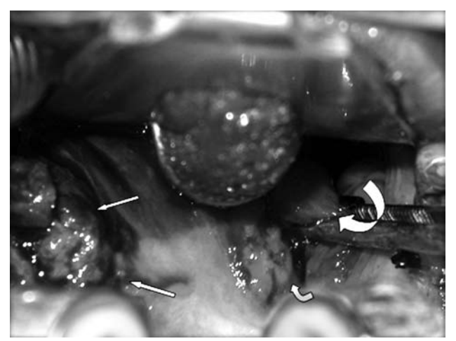
Fig. 1. Clinical appearance of the protruding mass from the soft palate. The mass involves left tonsillary fossa and the lesion is indicated by arrows at the left side.

The patient was taken directly to the operating theatre and general anaesthesia was induced. On the clinical examination, there was a, fragile, tender mass 5x7 cm in size in the left soft and hard