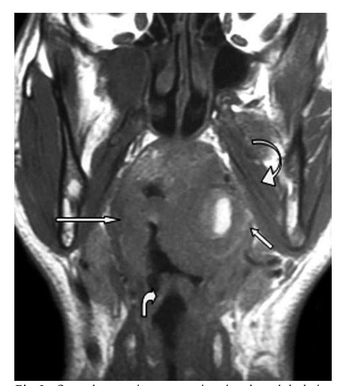
Fig. 3. Coronal magnetic resonance imaging showed the lesion extending from the left median pterygoid muscle (curved arrow) to the right palatin tonsil (tall arrow) and inferiorly the epiglottis (small curved arrow) by involving left tonsillary fossa (small arrow).

Some authors consider SANS to be an unusual subtype or early stage of NS, while some others think that it is a distinct and specific entity of infec-