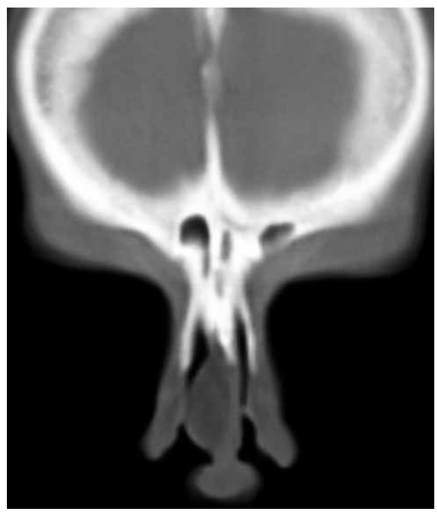
Figure 1. A coronal section computed tomography scan shows a demarcated dens mass located at the right submucopericondrial level obstructing the nasal cavity.

septum was deviated to left side. Besides these findings no abnormalities were detected in the head and neck region. Computed tomography scan revealed a clearly demarcated dense mass located at the right submucopericondrial level obstructing the nasal cavitiy (Figure 1). No connection between the mass and cranium was observed.