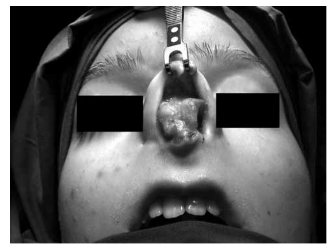
Figure 2. A mass was observed directly at the right alar region. The alar cartilage was rudimentary and the domal cartilage complex was absent.

An open septorhinoplasty was performed not only for removal of the mass but also for correction