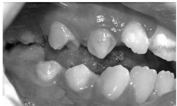
Figure 2. After treatment comprised oral hygiene instruction and removal of the carious deciduous teeth.