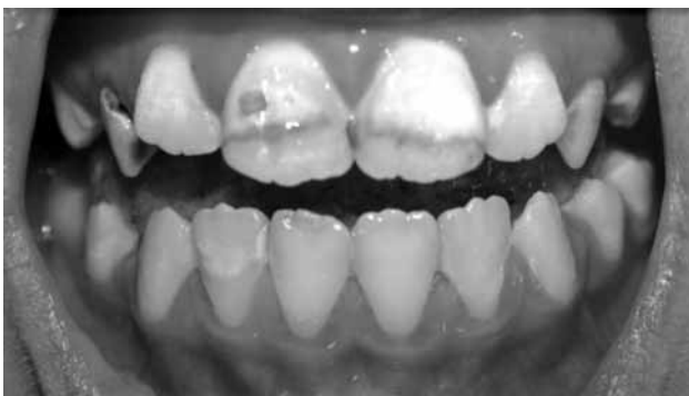
Figure 1. Discoloration of maxillary incisors and carious deciduous teeth.

Case 2- A 12-year-old girl was presented to the Oral Surgery and Medicine Clinics of Dental Faculty with a complaint of recurrent swelling in her tongue. The patient's family was aware of the condition since she was three years old. However no biopsy had been performed before. On anamnesis the patient's mother described that this swelling occurred mostly after an episode of tonsillitis along with fever. No remarkable items were detected in the patient's medical history. In our intraoral examination a lesion, consisting of multiple raised blisters was seen on the left side of the tongue invading both the dorsum and the ventral side. The patient did not have problems with either dentition or occlusion since the tumor was not so big that the tongue was located inside the arches. The intraoral examination revealed caries especially in the left premolars and molars in both maxillary and mandibular arches (maxillary and mandibular first molars and mandibular first premolar teeth were carious), and also the gum inflammation was remarkable. A biopsy was performed, after which the carious teeth were restored along with periodontal treatment. Oral hygiene instructions were given and the patient was taught how to brush her teeth properly. A smaller and softer toothbrush was recommended, especially for the left side with the lesion. After dental treatment, the complaints were gone. According to the