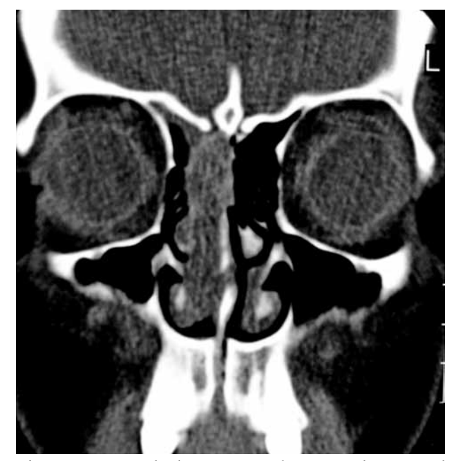
Figure 1. Paranasal sinus computed tomography, coronal section, showing soft tissue mass filling the right nasal cavity without bone erosion.

The patient was followed with monthly endoscopic examinations for the first postoperative year and every three months thereafter. Control CT imaging was performed