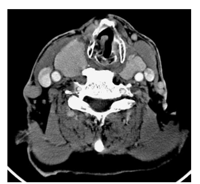
Figure 1. Axial computed tomography scan of the neck: tumor in the right glottic area.