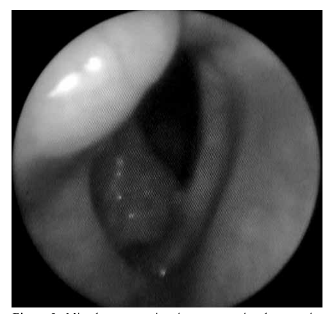
Figure 3. Microlaryngoscopic view: tumor in the anterior two thirds of the right vocal cord extending to right ventricle.

We performed microlaryngoscopy under general anesthesia and broad-based deep biopsies were taken from the smooth surface of a polypoid tumor located at the anterior two thirds of the right vocal cord with extension to the right ventricle (Figure 3). Histopathological examination revealed a submucosal spindle cell tumor with moderate nuclear polymorphism, Ki-67 positivity in 30% of the tumor cells and mitotic activity (4 in 10 high power field), compatible with leiomyosarcoma (Figure 4). The mediastinal lymphadenopathies biopsied