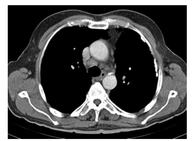
Figure 2. Axial computed tomography scan of the thorax, mediastinal window: mediastinal lymph nodes.

A 68-year-old man with a past history of diabetes mellitus, hypertension and thyroidectomy for multinodular goiter presented with hoarseness in the last three months. He had quit smoking 10 years ago with a past smoking history of 30 pack years. At his first visit to another otolaryngology clinic, microlaryngoscopy and biopsy was performed on the right vocal cord and pathology was reported as 'mucosal ulceration'. The biopsy was reported as 'suspicious for leiomyosarcoma'. The patient was referred to our department.