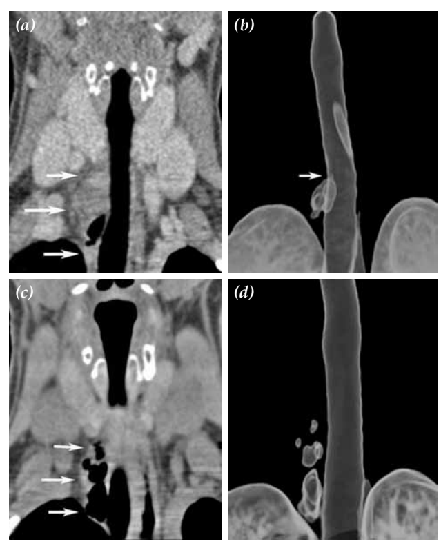
Figure 2. (a) Computed tomography with coronal reconstructed image shows the infected paratracheal diverticulum (arrows). (b) Volume-rendered three-dimensional image clearly reveals the narrow connection (arrow) between the trachea and the diverticulum. (c, d) After antibiotic treatment, most of the lumen of the diverticulum was filled with air.

musculature of the trachea wall due to repeated respiratory infections. Typically, the acquired form has wide connections to the trachea and is larger than the congenital one. This form can appear at any level and consists of only respiratory epithelium and lacks cartilage or smooth muscle.<sup>[2,3,7]</sup>