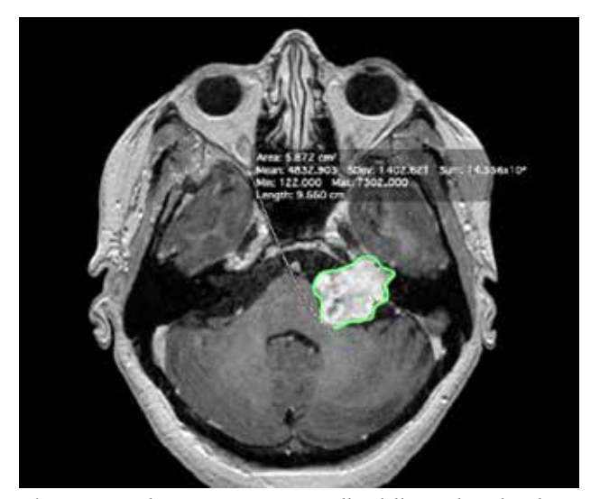
Figure 1. Each tumor was manually delineated and volume calculation was done using OsiriX software. This process takes few minutes for each tumor depending on complexity of the tumor shape.

When the tumor volumes in the initial and final scans were compared, a decrease or an increase up to 20% in the tumor volume compared to baseline was defined as local tumor control. Tumor progression was defined as a tumor volume increase of \geq 20% of the initial volume. Transient swelling was defined as a tumor volume increase in the first follow-up