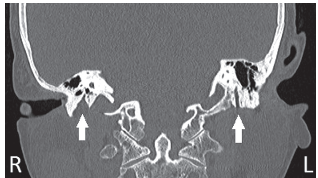
Figure 2. Smaller temporal bone and reduced pneumatization at the atretic side (right). The differences between the right and the left side in terms of mastoid segments of Fallopian canal, extratemporal facial nerve, and stylomastoid foramen.

findings supported pleomorphic adenoma, but the diagnosis was non-specific. Magnetic resonance imaging (MRI) revealed a right infraparotidal cystic lesion with multiple septations, hypointense on T 1 -weighted images, hyperintense on T 2 -weighted images, with contrast enhancement of the capsule. Computed tomography (CT) demonstrated limited temporal bone pneumatization and smaller total size on the atretic side compared with the contralateral healthy ear. The stylomastoid foramen on the atretic side was superiorly located, so the mastoid segment of the right fallopian canal was shorter than on the left side (Figure 2).