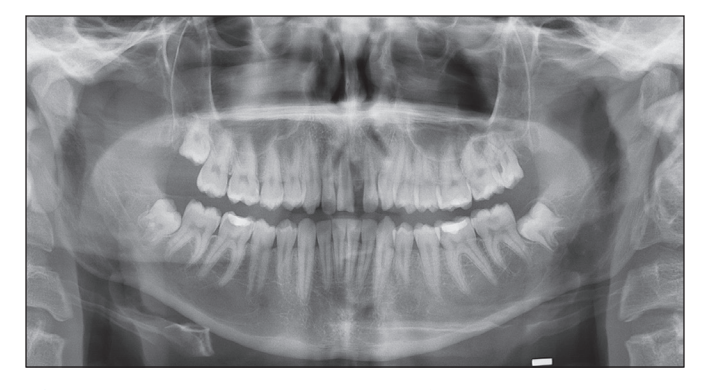
Figure 4: Postoperative panoramic radiograph reveals uneventful healing.

mon (1). The rare occurrence and complexity of intrusion of permanent teeth may lead to a complicated healing scenario and an uncertain prognosis (4).