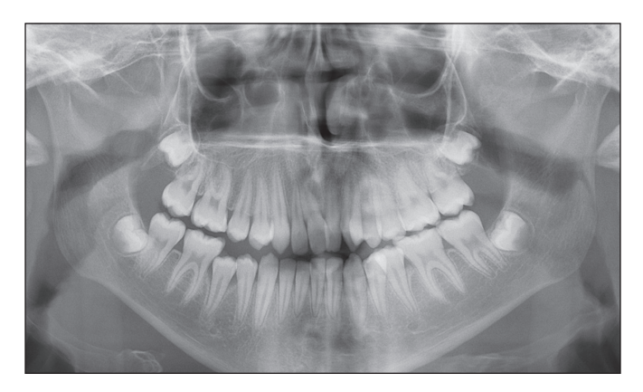
Figure 2: Postoperative panoramic radiograph reveals uneventful healing.

tooth in a palato-vertical direction above the apex of the right central incisor (Figure 3B), which was classified as "severe intrusion" (3).