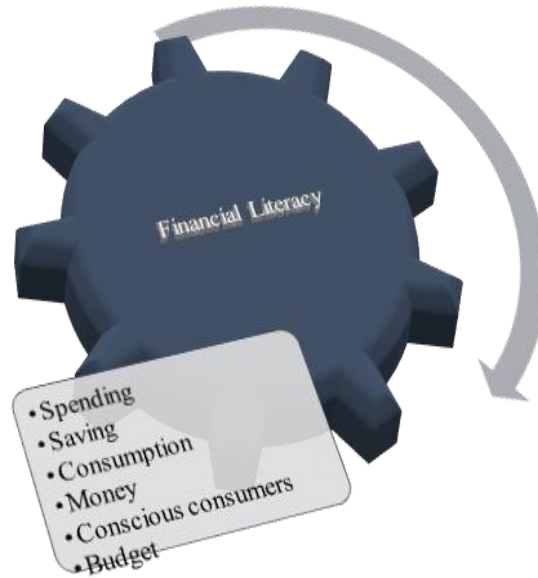
Figure 1. Concepts related to financial literacy

It can be said that many remarkable concepts related to the concept of financial literacy are used in the education process. These concepts are given in Figure 1 below.