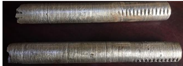
Figure 2. Sample of composite after tensile test.