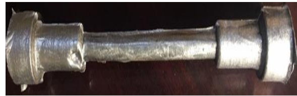
Figure 1. Sample of composite after die-casting.

In Table 2, results showed that hardness of the composite varied for all samples, at the different percentage by weight of reinforcement. At 15% by weight of reinforcement, the average hardness of the composite had the highest value while the lowest hardness was recorded at 5% by weight of reinforcement.