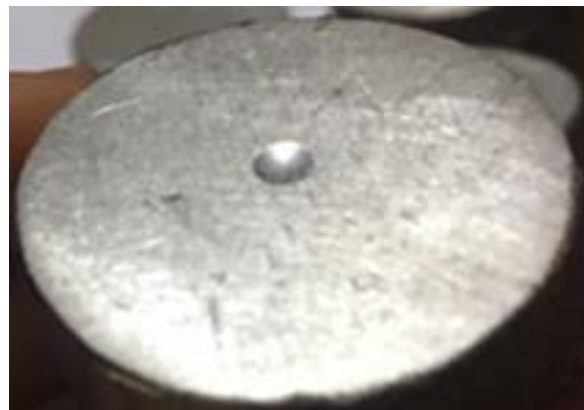
Figure 3. Samples of composite after hardness test.