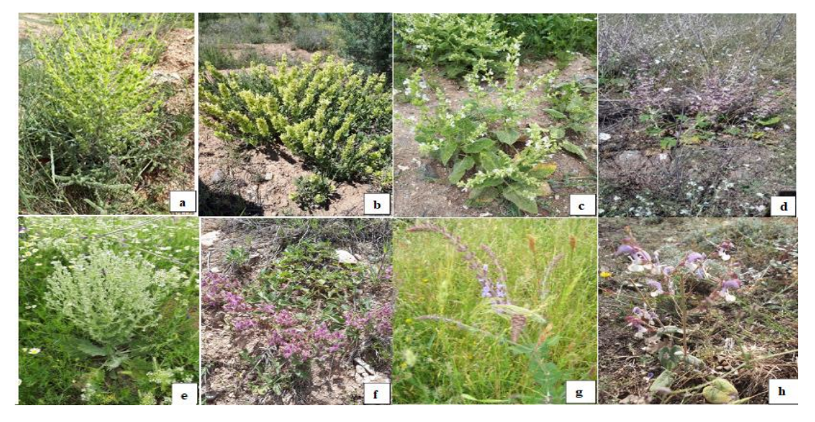
Figure 1 . Salvia ceratophylla (a), S. absconditiflora (b), S. syriaca (c), S. sclarea (d), S. aethiopis (e), S. bracteata (f), S.virgata (g), S. cyanescens (h) Şekil 1. Salvia ceratophylla (a), S. absconditiflora (b), S. syriaca (c), S. sclarea (d), S. aethiopis (e), S. bracteata (f), S.virgata (g), S. cyanescens (h)

syriaca L., Salvia ceratophylla L., Salvia bracteata Banks et Sol., Salvia cyanescens Boiss. & Bal., Salvia sclarea L. and Salvia virgata Jacq. species spread naturally in Kırşehir city (Figure 1). Table 1 shows the information on the locations where the species spread.