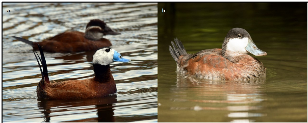
Figure 2. (a) The European White-headed duck and the (b) American Ruddy Duck can hybridize

A currently discussed topic concerns the hybridisation of ruddy ducks (Figure 2), of which the White-headed duck ( Oxyura leucocephala ) is native to Spain and other regions of the Mediterranean area. The American Ruddy duck ( Oxyura jamaicensis ) escaped from zoos in Great Britain and has thus established itself as a newcomer. The British Ruddy Duck population comprised over 6000 individuals until a few years ago. These Ruddy Ducks are increasingly spreading and have already met on the native White-headed Ducks in Spain. Although they are clearly separate allopatric species, apparently no mating barriers exists and hybridisation with fertile offspring occurred. These hybrids also interbreed with the European White-headed Ducks, so that the White-headed Duck is in danger of becoming extinct as a genetically distinct species (a phenomenon termed “genetic swamping”). In the UK, Ruddy Ducks have now been systematically shot, so that the population there now only comprises between 50 and 100 individuals.