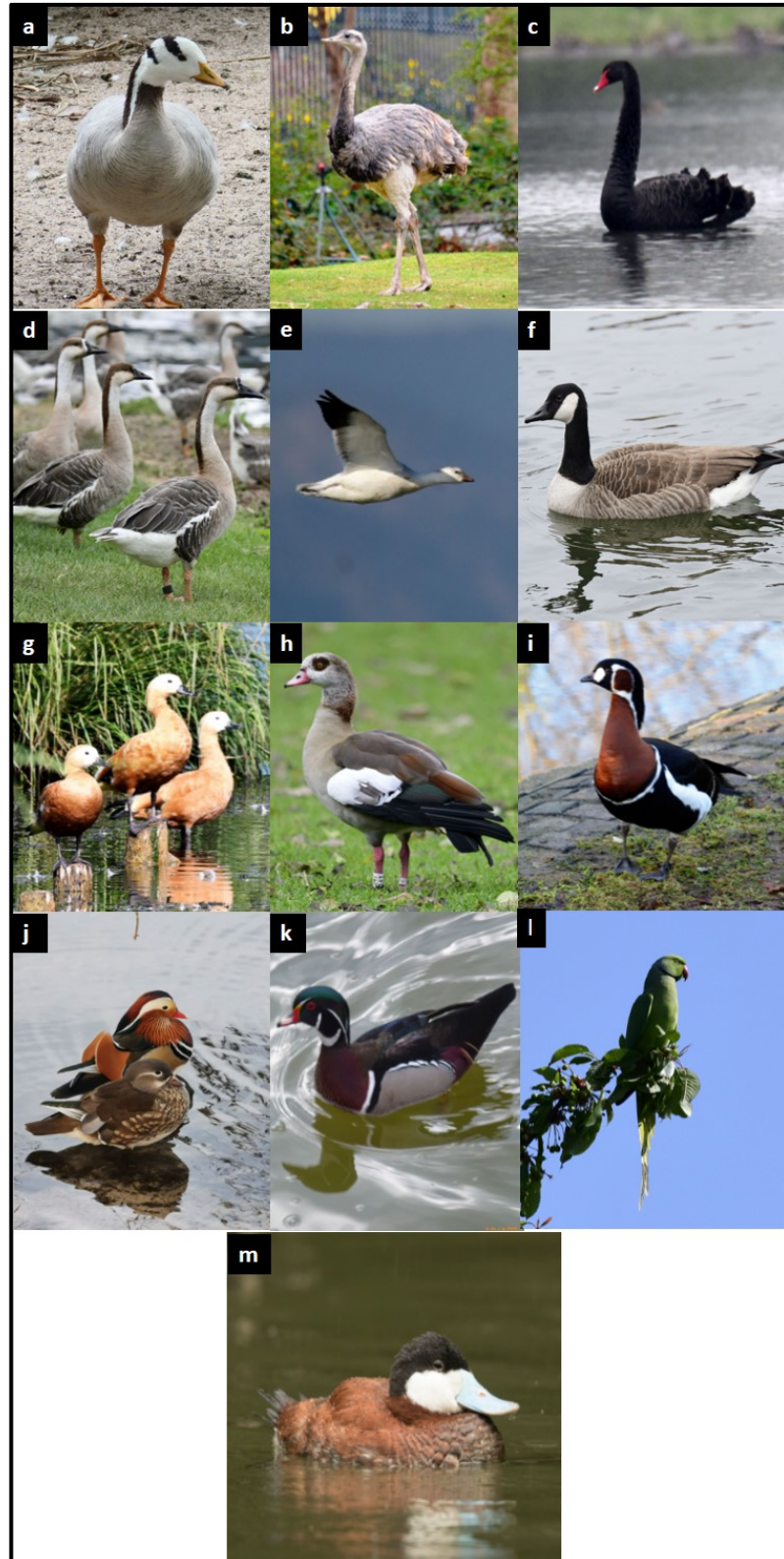
Figure 1. Examples of alien and successfully introduced birds in Europe. (a) Bar-headed Goose (b) Nandu, (c) Black Swan, (d) Swan Goose, (e) Snow Goose, (f) Canada Goose, (g) Ruddy Shelduck, (h) Egyptian Goose, (i) Red-breasted Goose, (j) Mandarin Duck, (k) Wood Duck, (l) Rose-ringed Parakeet and (m) Ruddy Duck.