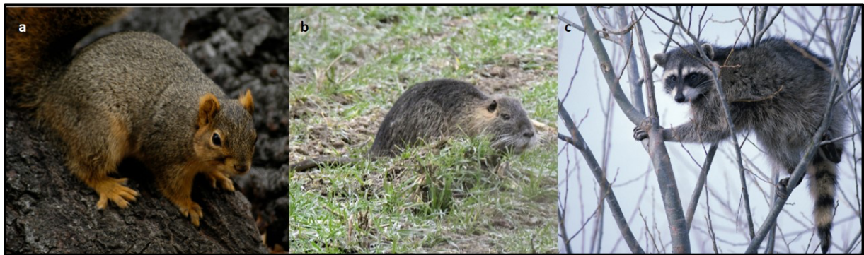
Figure 3. Examples of introduced mammals. (a) Grey Squirrel, (b) Nutria, (c) Raccoon and Raccoon dog

A number of mammals, which had been introduced for fur production, such as Mink and Raccoon (Fig. 3), have escaped and deliberately set free in Europe. As predators, these species cause harm among European reptiles, amphibian, birds and mammals. Most scientists agree, that these taxa are invasive and that they have a negative balance.