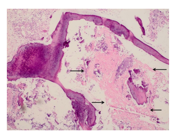
Figure 3. Necrosis spaces between bone specule

The patient was re-admitted to the hospital with the complaints of high fever (38.1°C), severe hip pain and limping one week after discharge. ESR was 120 mm/hour, CRP 90 mg/dl and WBC count 10.2 x 10<sup>3</sup>/µl. Effusion in the hip joint and destruction of the femoral head cartilage was observed on MRI. The patient was immediately re-operated. The joint