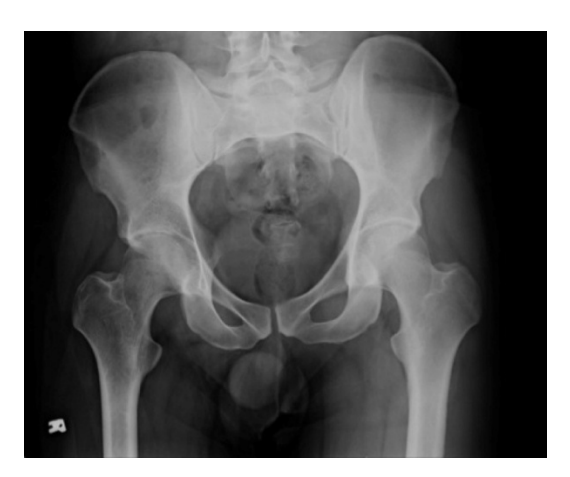
Figure 1. X-ray AP pelvis. Osteopenia beginning from the trochanteric region and includes all of the iliac wing on the right hip.

decompression and aspiration from the hip were performed in the operating room under fluoroscopic assistance. Samples obtained from the femoral head and joint fluid were sent to the pathology and microbiology department. Pain decreased postoperatively, although it did not completely resolve. No abnormality was detected in rheumatologic examinations (Rheumatoid factor, HLA-B27, Antinuclear antibody, Antimitochondrial antibody). Gram (-) bacilli was observed in the smear and teicoplanin 400 mg 2x1 was initiated.