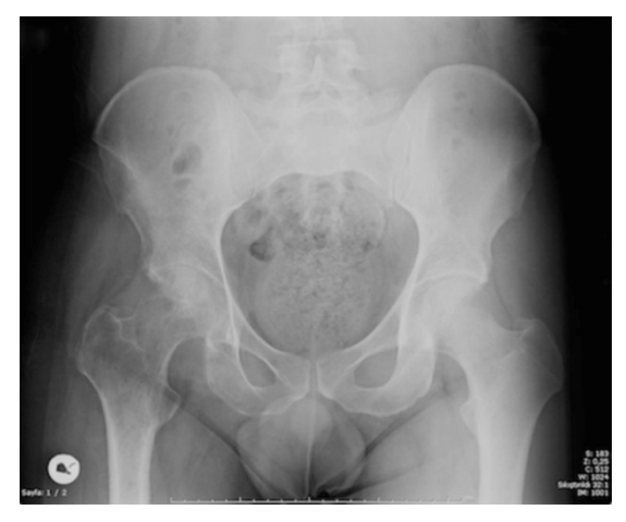
Figure 4. Ficat-Arlet grade 3 avascular necrosis on the right hip.

was approached again from the posterior, while irrigation and debridement for synovial tissues were performed. Erosion and collapse were found in the femoral head cartilage. No growth was observed in the culture collected from the joint fluid. In addition to ciprofloxacin 2x400 mg, daptomisyn 1x500 mg IV was initiated. The patient developed Sudeck's atrophy in the right lower extremity. Passive exercise therapy was started. The patient did not develop fever in the follow-up period. Pain and limping continued at the 6th postoperative month. ESR, CRP and WBC tests were normal but stage 3 avascular necrosis was observed in radiographs (Fig 4). The patient underwent total hip arthroplasty at the 8th postoperative month and pain was relieved and the patient was able to walk without the aid of a crutch at the 1 year follow-up.