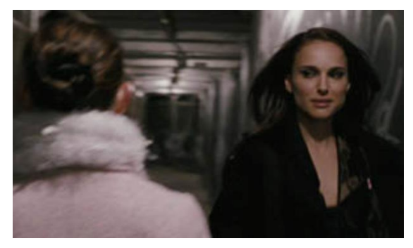
Black Swan, 2010.7

legend, Leda's children Castor is from her husband; Polluks is from Zeus as a result of this unit.<sup>6</sup> Aforementioned twins are the seeds that fell into the same womb from two different origins. In the Black Swan, two different origin archetypes in the same womb appear as Black and White twins.