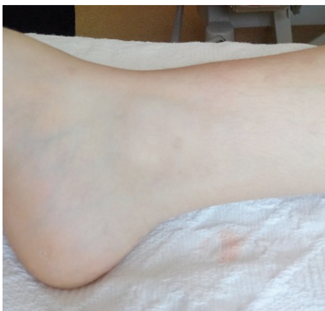
Fig. 1. The view of the minimal edema on the skin of upper medial part of the right ankle

An 11-year-old boy was admitted to our hospital with the complaint of pain and swelling around the right ankle for the last three weeks. It was learned that he had chickenpox one month ago and the eruptions healed in two weeks. As the child had pain on the right ankle, the family consulted a pediatrician and he was referred to pediatric rheumatologist with the initial diagnosis of reactive arthritis secondary to chickenpox. On physical examination, the skin integrity was intact on the whole body and there were a few healed chickenpox eruptions but there was not any pain, effusion, hyperemia, warmth or restriction of movement on the right ankle. There was edema, warmth, pain by palpation on the upper medial part of the right ankle (Fig. 1). The physical examination was otherwise unremarkable. He was born as triplet on the 34 th week of gestation with the birth weight of 1350 gr. He had a 10 day history of hospitalization postnatally. He had never been hospitalized since then and the family denied any recurrent infection episodes.