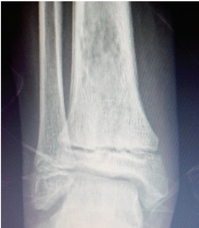
Fig. 2. The view of the radiolucency and minimal periosteal reaction on the metaphysis of the distal tibia