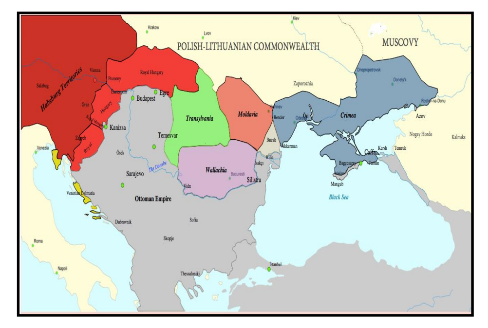
Map 1: Ottoman Provinces and Tributaries in Europe

troops on the Ottoman side of the Habsburg-Ottoman frontier was about 30,000.