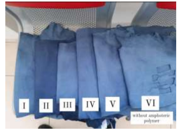
Figure 3. The leathers which were used different commercial amphoteric polymers

case of sample II possibly more on the surface of the leather.