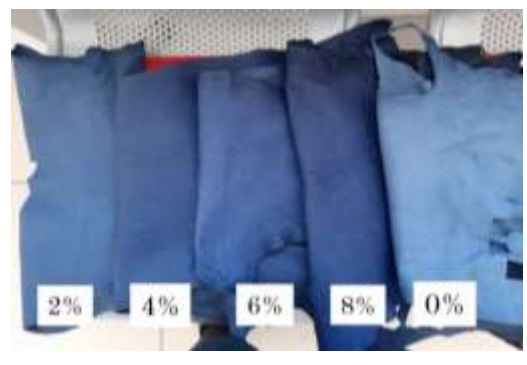
Figure 4. The leathers processed with different ratios of the amphoteric polymer

The colorimetric coordinate values of the leathers processed with different ratios of the amphoteric retaining agent were given in Table 9 and the images of these leathers were presented in Figure 4.