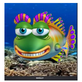
Figure 2. MARLEY