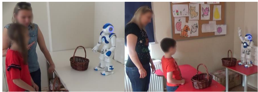
Figure 3. Interventions using the NAO

As mentioned in the methodology section, the research study was based on the single-subject research model and one girl and one boy aged 6-8 years who were diagnosed with ASD participated in the study. In order to eliminate any potential risks, the scenarios had been created and tested with the simulated NAO using Choregraphe software ("NAO Software 1.14.5 documentation", 2021), as shown in Figure 4. Then, the scenarios were deployed to the real NAO and the interventions were realized. The NAO presented the skill steps of the game to the children using a hierarchy of prompts from the most moderate prompt to the least moderate prompt level. During the process, the independent variable was applied two days a week. For each of the children, two teaching sessions consisting were held on each day designated for teaching the target behavior and five trials were conducted in each of the teaching sessions.